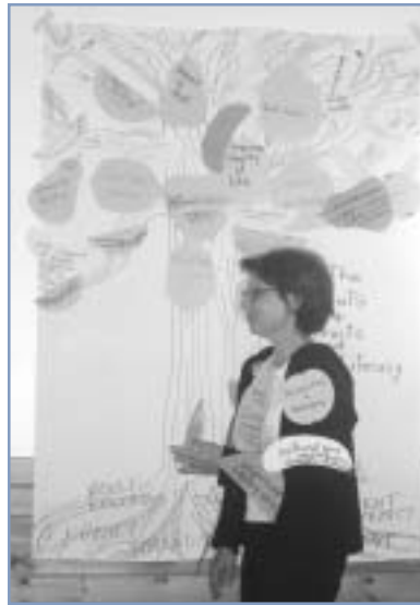
The roots and fruits of Family Literacy.

Participants also used the week to network with their counterparts from various parts of Saskatchewan as well as from Manitoba. As usual, participants shared their experiences and learned a great deal from each other as well from the presenters.