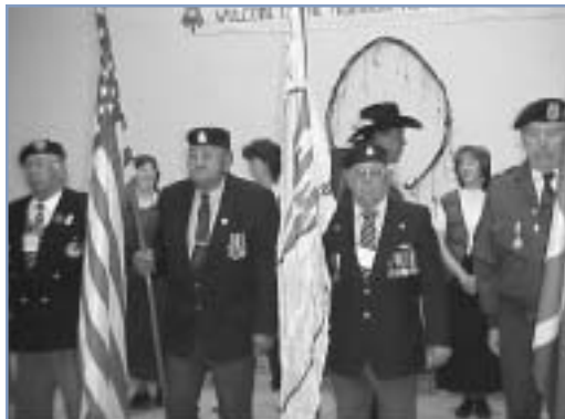
Flag bearers: Treaty 4 Veterans.

In summary, the Provincial Aboriginal Literacy Gathering was an innovative approach to bringing people together as a learning community for three days, with a plan for ongoing support and development of Aboriginal Literacy based on their visions and recommendations for the future.