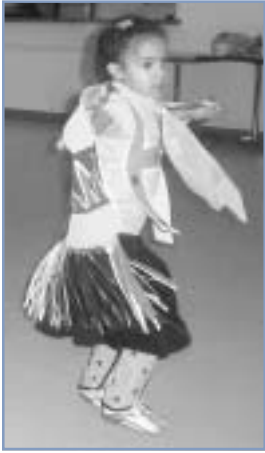
An adorable Aboriginal dancer.