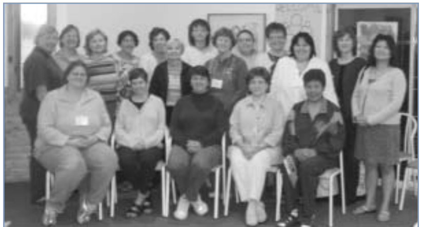
Saskatchewan participants and trainers.

Feedback from participants indicated that the training was well organized and extremely useful. Those in attendance appreciated the participatory nature of the training. The next step will be to develop a plan for future foundational training.