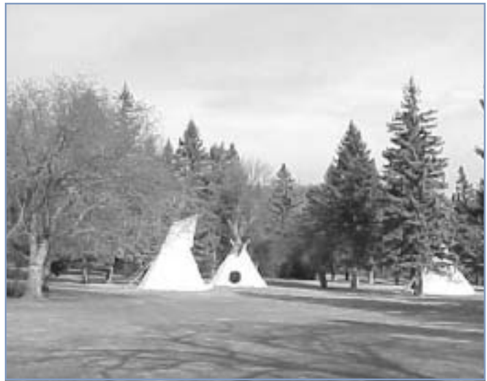
Teepees at the Echo Valley Conference Centre.