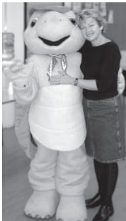
Franklin and his creator, Brenda Clark.

Plans will soon be underway for next year's event. To become involved in this, or other local literacy activities contact the Prince Albert Literacy Network at 922-6736.