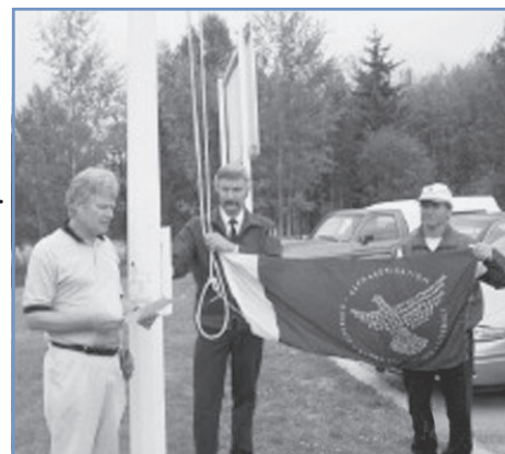
Flag raising in La Ronge.

included live, local musicians set up like a coffee house (in a restaurant) on Saturday, Sept 6th. Information about the Northern Literacy Strategy and college programs were passed out. A smaller coffee shop agreed to host readings by members of a local writers group on Sunday, September 7th. Again, information about literacy programs was distributed.