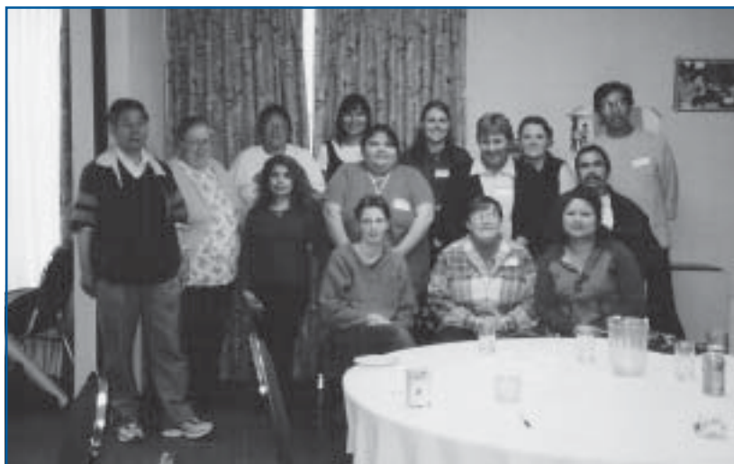
Participants at The Wisdom Within Conference.