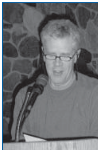
Poet Laureate, Stuart McLean, reads his PGI inspired poem.