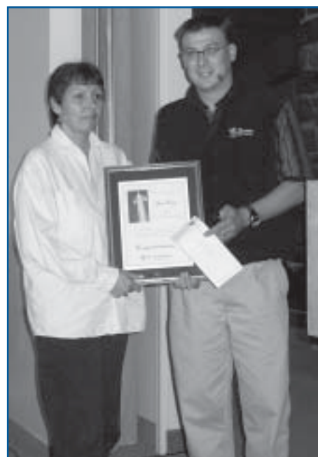
The Co-operator's Learner Award Winner is presented a cheque and plaque.

host for the evening and she wowed us with wit and humor from beginning to end. The banquet was loaded with prizes for our golfers and another successful Silent Auction. Support for the PGI Golf Tournament for Literacy is growing in Saskatchewan and everyone should be proud!