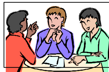
National Volunteer Appreciation Week April 21-27, 2002.

In closing, your talents, expertise and opinions are needed in the form of contributions and suggestions for Networking . As always, we welcome any feedback you provide. If it is important to you, it is important to Networking !