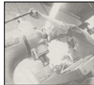
Machinist : Jaren McLeod

When will Women's Studies begin to influence vocational training programs as they have university and college courses? While there have been feminist methods and content evident in some courses, especially bridging programs, there is no sign of Women's Studies in program training women for non-traditional work.