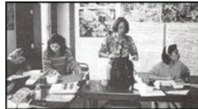
Women in a BRIDGES classroom

At BRIDGES, all curriculum areas work together toward changing the woman's perception of herself to that of an individual who can and wants to learn. We feel it is important to assess knowledge and attitudes, to start teaching from where she is now, to create a supportive and positive learning environment, and to design activities that are experience-based and challenging.