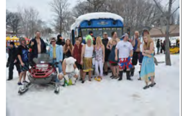
Moments before the 2011 Polar Bear Plunge.

If you aren't jumping into the lake, please join us at 2 p.m. to help cheer on those who are.