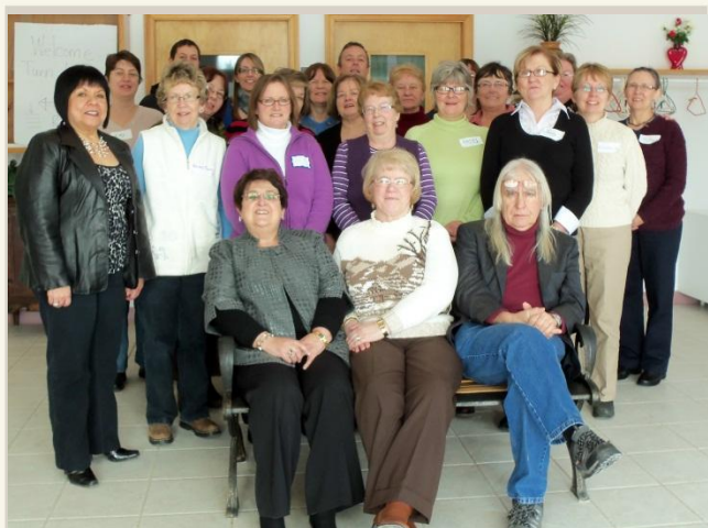
TUTORS & PRESENTERS AT KESWICK VALLEY ITT WORKSHOP JANUARY 29TH