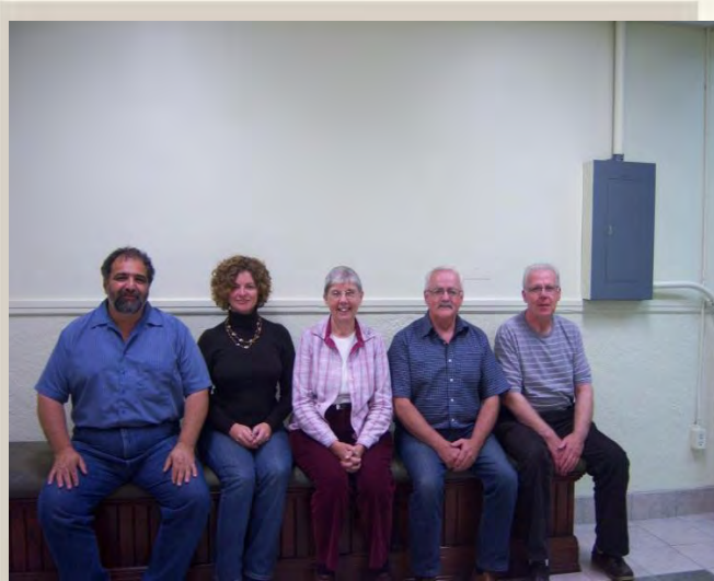
MONCTON TUTOR TRAINING WORKSHOP PARTICIPANTS

The Council of Atlantic Ministers of Education and Training (CAMET) launched their “Literacy is More Than You Think” TV ads on November 1 st . Check their website at www.camet-camef.ca