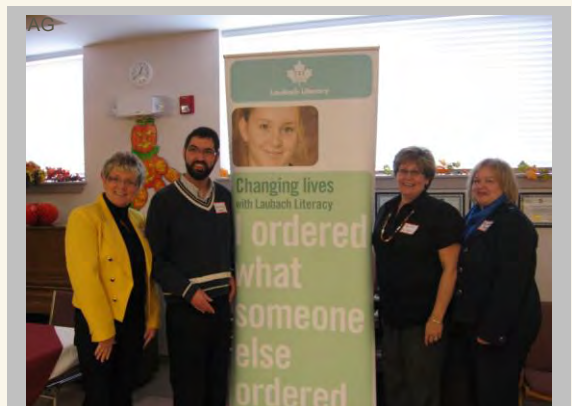
AGM 2010 Photo taken at People's Park Tower in Moncton

On November 2 nd , a final AGM meeting of the Movement for Canadian Literacy (MCL) was held. The Canadian Literacy and Learning Network (CLLN) has a new logo and mission for knowledge-sharing, engaging partners and stakeholders, and raising awareness to advance literacy & learning in Canada.